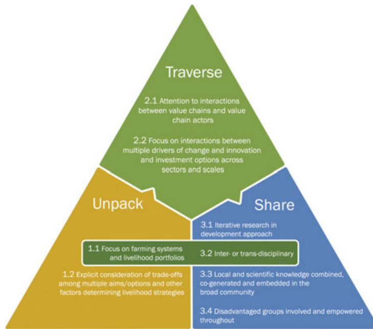
Figure 1. Three integrative principles that can operationalize the new dryland development paradigm. The principles provide a checklist for researchers and an evaluation framework for funders using the new DDP. The principles suggest that dryland development research must Unpack relationships, Traverse scales and sectors and Share knowledge. Each principle comprises a number of characteristics, two of which (1.1 and 3.2) cross-cut two of the principles. [Colour figure can be viewed at wileyonlinelibrary.com ]

Appendix S2 and summarized here under each integrative principle. Table S6 provides exemplar case studies from the CRP-DS in which the principles are operationalized together, with cases ranging from local and national to global studies, across a range of agricultural systems.