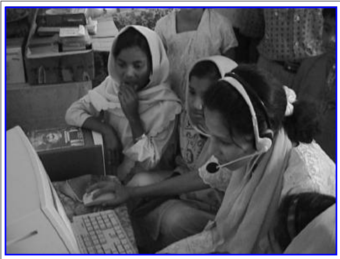
Figure 1. Children at Peace High School, Edi Bazaar, Hyderabad, India, working on their computer.

should try to improve their English pronunciation by reading passages from their school English textbooks into Dragon and to try to make Dragon recognize as much of their readings as possible. They were told to use Ellis if they wished, or to watch any film of their choice on the computer, if bored. It was suggested to each group that they should help each other and collectively organize what they would do with the computer when it was their turn to use it. There was to be no organized adult intervention after this point, except in case of any equipment failure and related maintenance activity. We relied on the earlier results (Mitra 1988, 2003; Mitra and Rana 2001) that groups of children can instruct themselves without teachers if given adequate computing resources. In effect, the children were left with a clear objective (to alter their speech until understood by the Dragon STT program) and a demonstration of the resources available (i.e., computer, Dragon, Ellis, and movies). They were asked to organize themselves to meet this objective and they