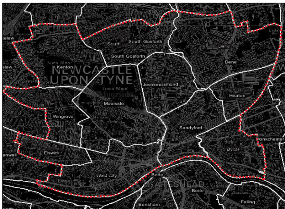
Figure 1 Case study area –The city of Newcastle upon Tyne

Newcastle upon Tyne was chosen as the case study area. The city of Newcastle upon Tyne is the major city in the northeast of England. The district of Newcastle has an area of 113km 2 and a population of about 270,000. The case study area consists 11 wards as shown in Figure 1 with the total size is approximately 18 km 2 .